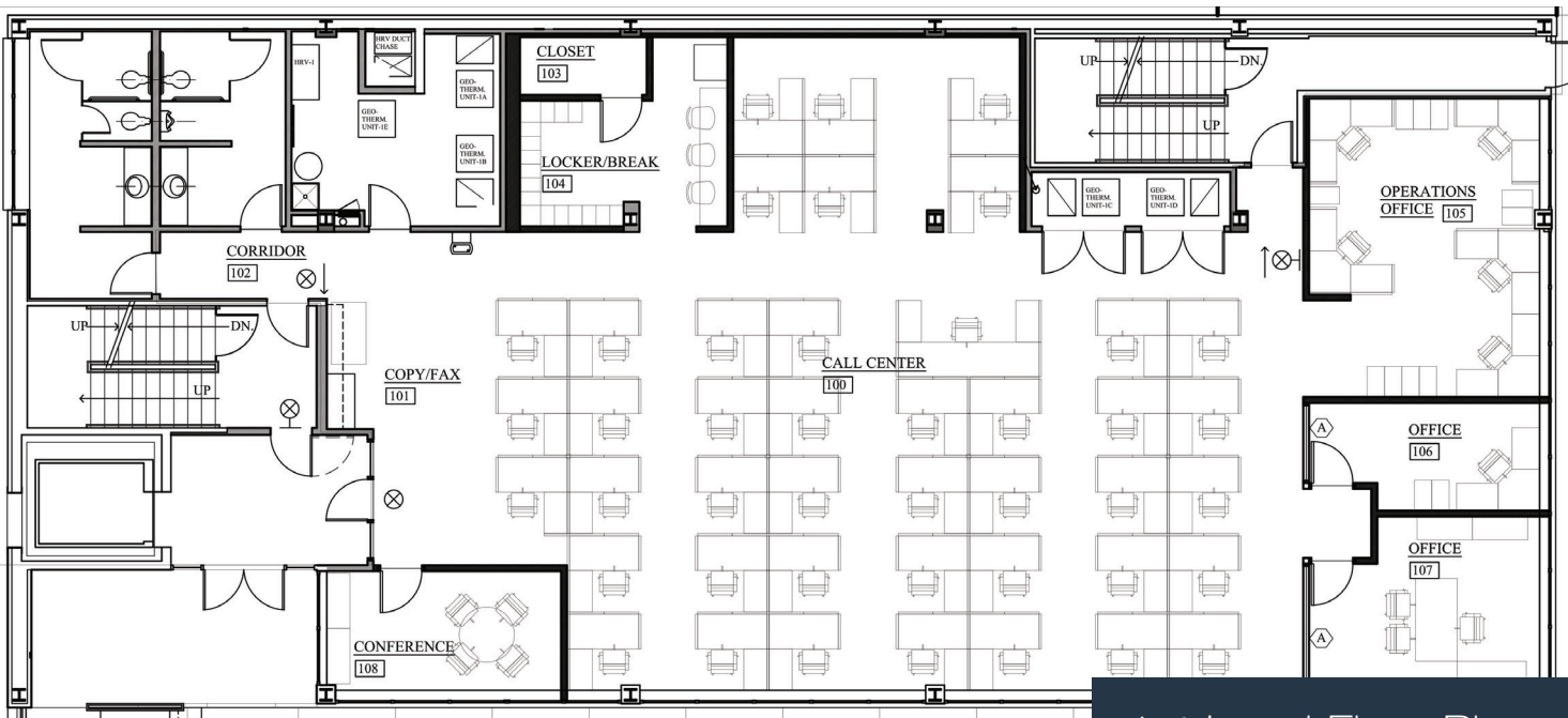
1st Level Floor Plan